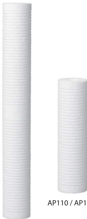
AP110 / AP124