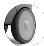
Large diameter non-marking wheels