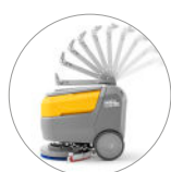
Adjustable and tiltable handle