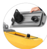
Removable lid + floater + motor protection filter