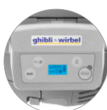
Control panel with display